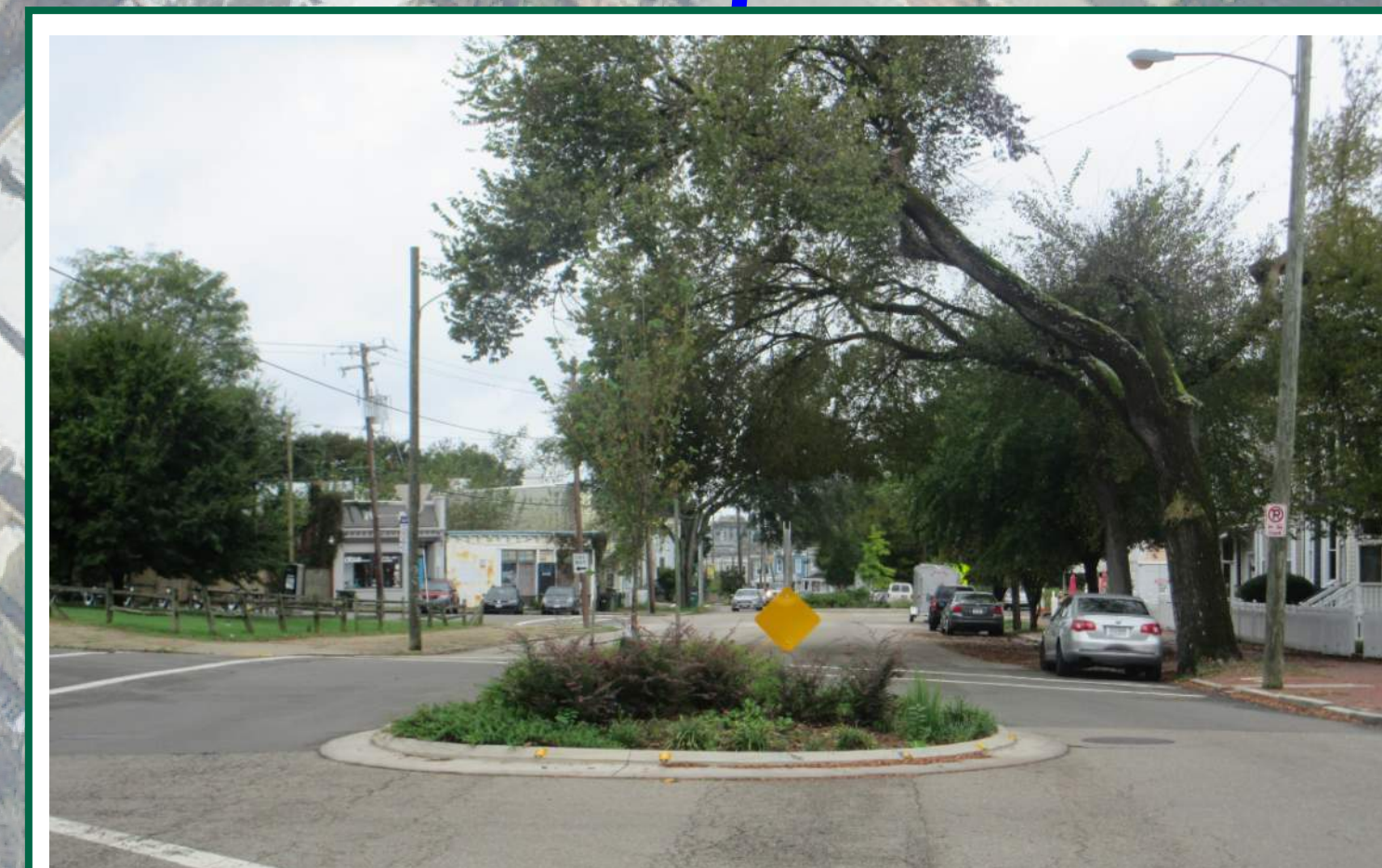
EXISTING - FOR REFERENCE ONLY