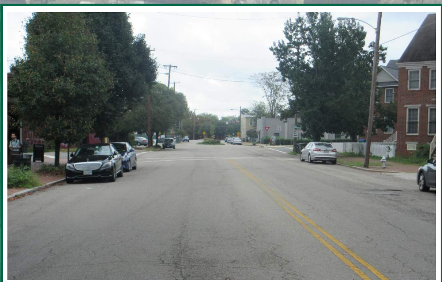
EXISTING - FOR REFERENCE ONLY