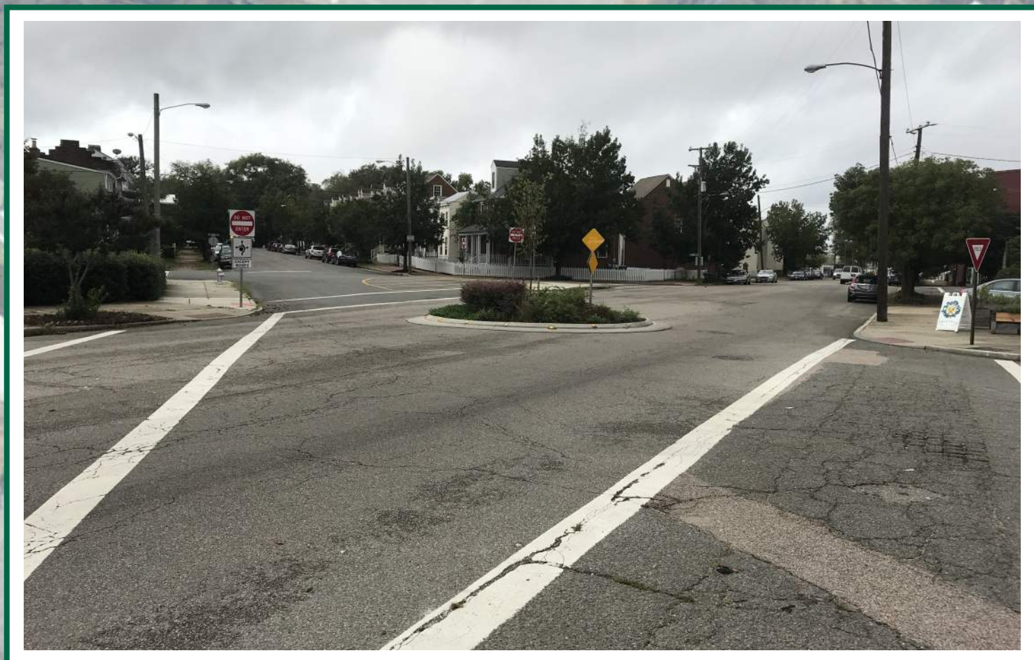
EXISTING - FOR REFERENCE ONLY