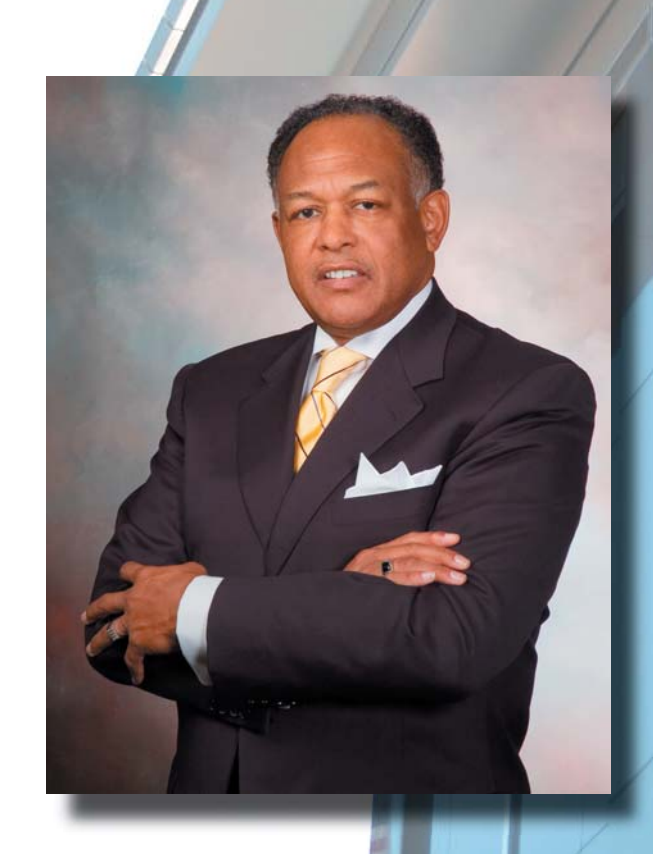
The Honorable DWIGHT C. JONES Mayor The City of Richmond, Virginia