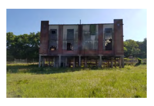
View of Building #2

7834 Forest Hill Avenue, Suite 7, Richmond, Virginia 23225 ph 804.716.0560 fax 804.918.7098 web FranceEnv.com