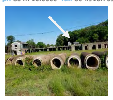
View of Sheds #2 and #3

7834 Forest Hill Avenue, Suite 7, Richmond, Virginia 23225 ph 804.716.0560 fax 804.918.7098 web FranceEnv.com