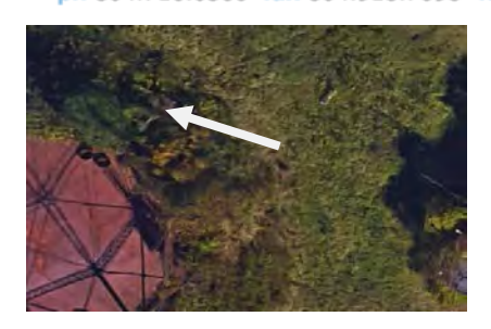
View of Shed #1

7834 Forest Hill Avenue, Suite 7, Richmond, Virginia 23225 ph 804.716.0560 fax 804.918.7098 web FranceEnv.com