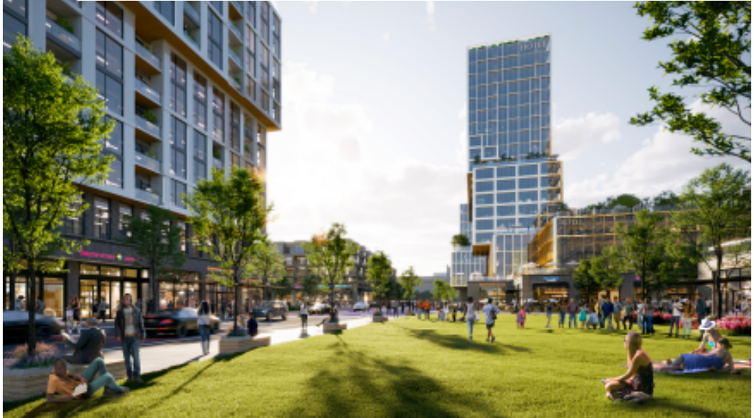
View looking south down 6th Street toward Blues Armory