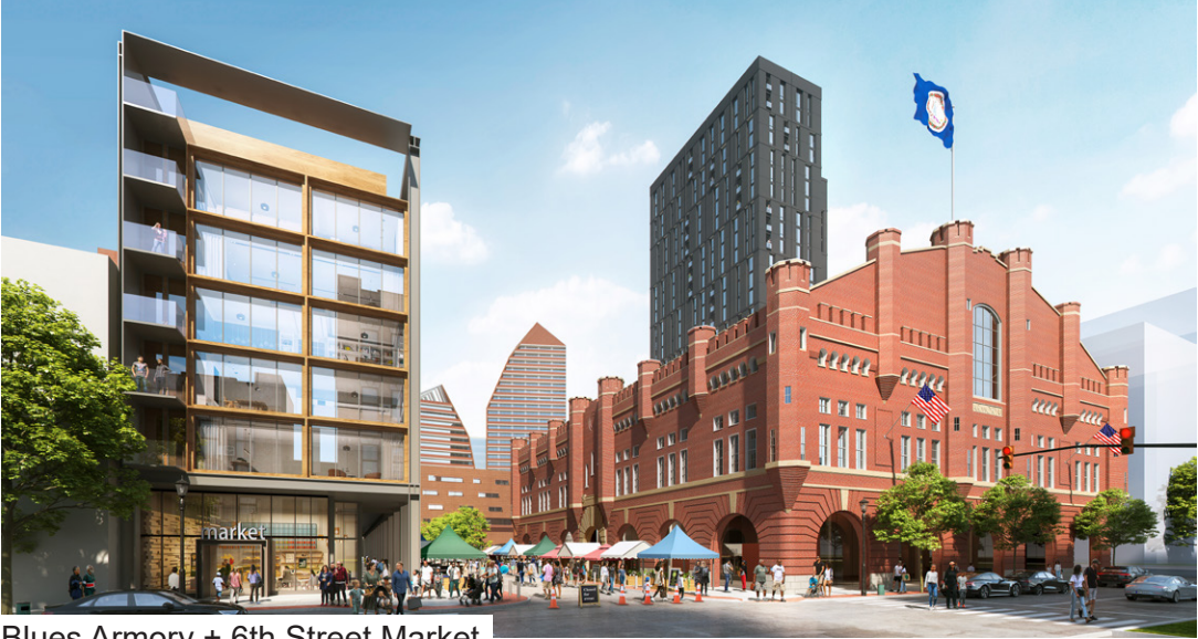
Blues Armory + 6th Street Market