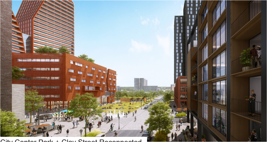
City Center Park + Clay Street Reconnected