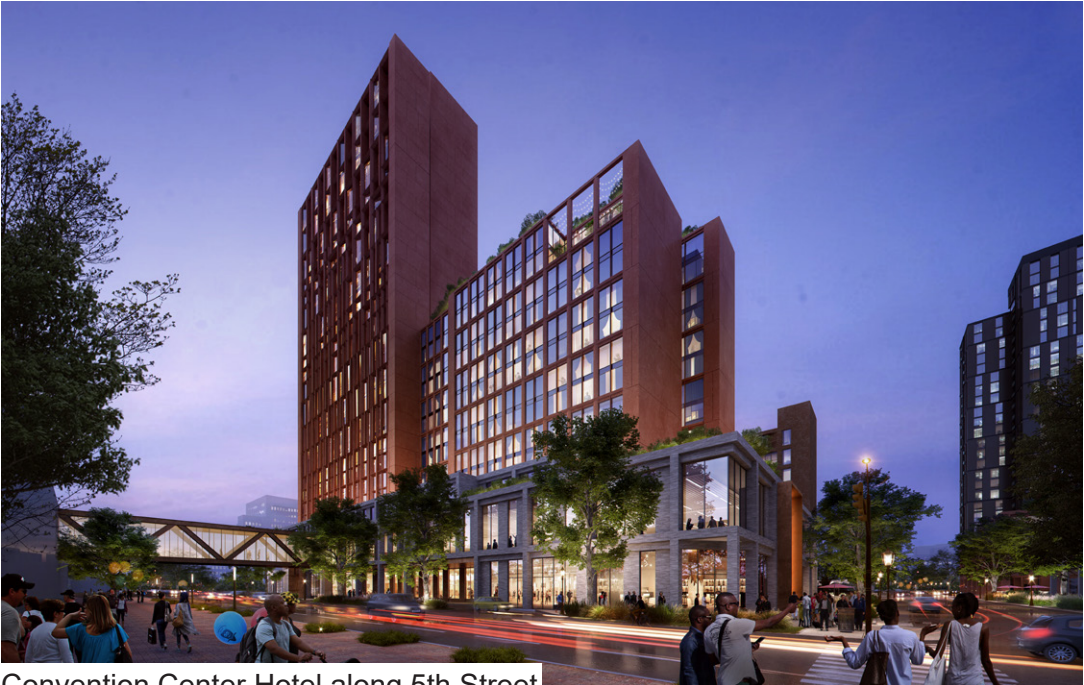
Convention Center Hotel along 5th Street