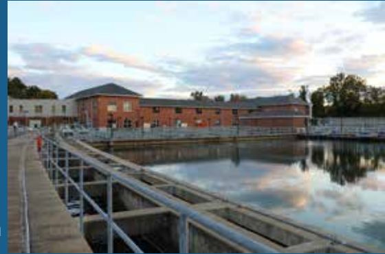
City of Richmond Water Treatment Plant

DPU is marking Drinking Water Week by engaging the community in understanding the vital role of clean, safe water in daily life, including its importance for public health and environmental protection. Drinking Water Week also acknowledges and celebrates the essential water professionals whose expertise and commitment ensure the delivery of high-quality tap water every day.