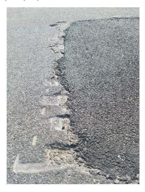
Marks from where temporary was dug up creating ¼ inch dips in road.