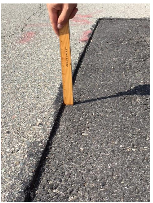
Not even with the road. Between ¼ and ½ inch.