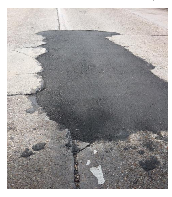
Concrete street restored with Asphalt, not squared.