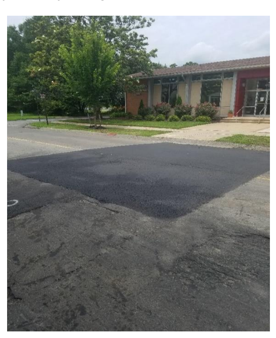
Concrete Repair Before (left) and After (right)